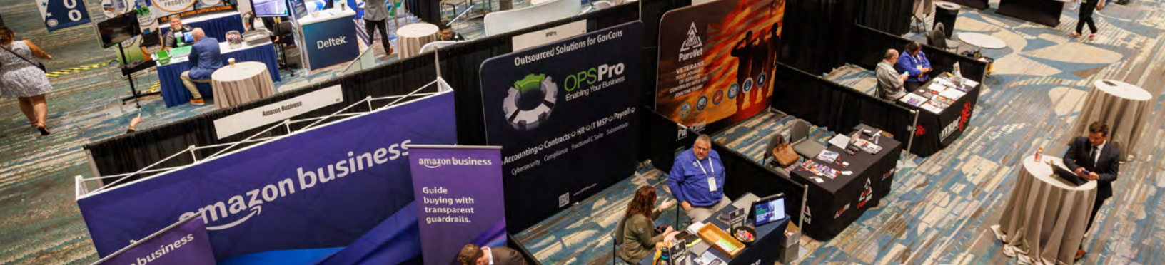
EXHIBIT FEES & BOOTH PACKAGES